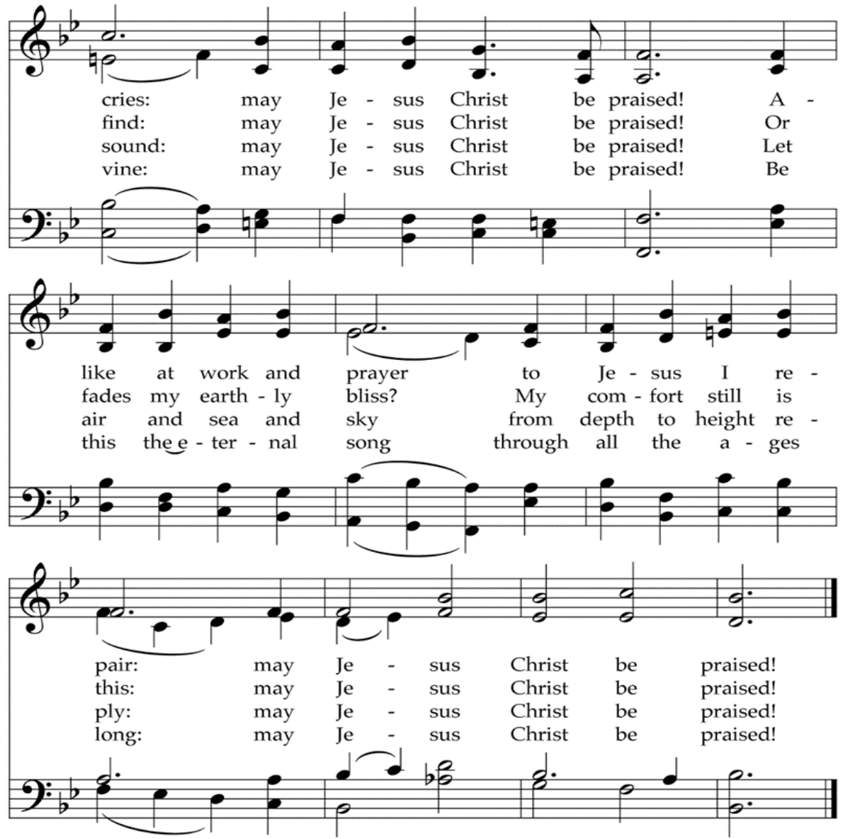
This is not just a morning hymn, though this excerpt from an English translation of an early 19th-century German text may not convey how thoroughly the original deals with different kinds of time throughout the day. The tune was composed as a setting for this English text.

TEXT: German hymn, c. 1800; trans. Edward Caswall, 1853, 1858, alt. MUSIC: Joseph Barnby, 1868