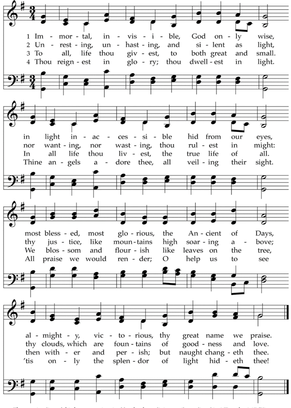
The opening line of this hymn was inspired by the three divine attributes listed in 1 Timothy 1:17 (King James Version), and it continues by considering how God's life exceeds our own finite existence. The text is well set to a Welsh melody shaped by many three-note units.